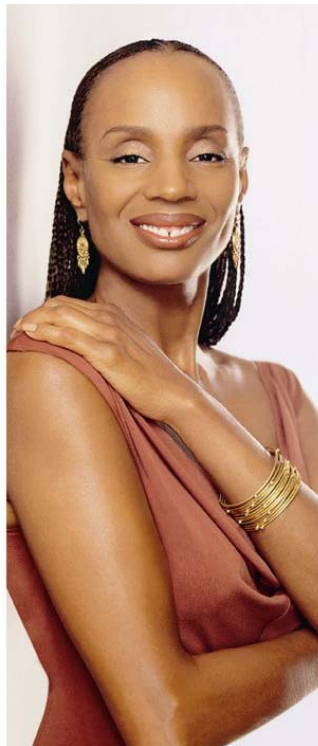
Susan L. Taylor, Editor Emerita of Essence magazine and Founder, National Cares Mentoring Movement.

—A Call to Action to Secure Brighter Futures for Vulnerable Children and Youth—